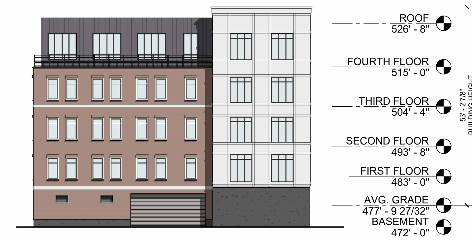
ELEVATION E SCALE: 1/16" = 1'-0" 5