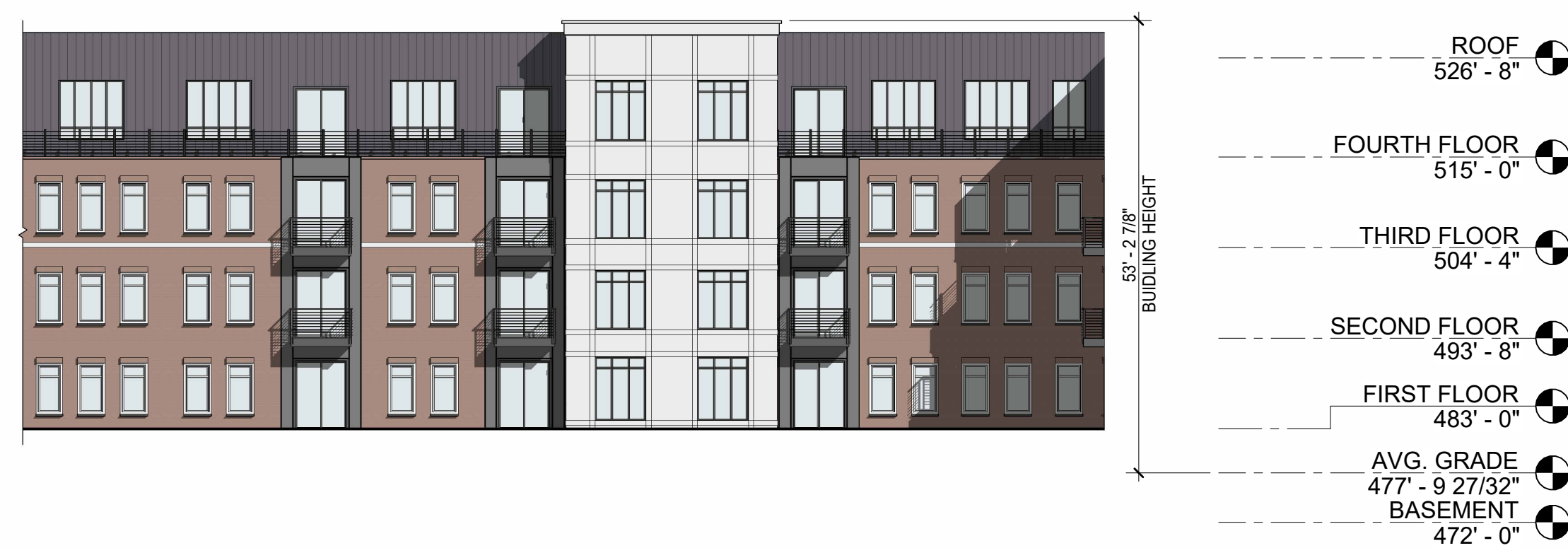
ELEVATION C SCALE: 1/16" = 1'-0" 3