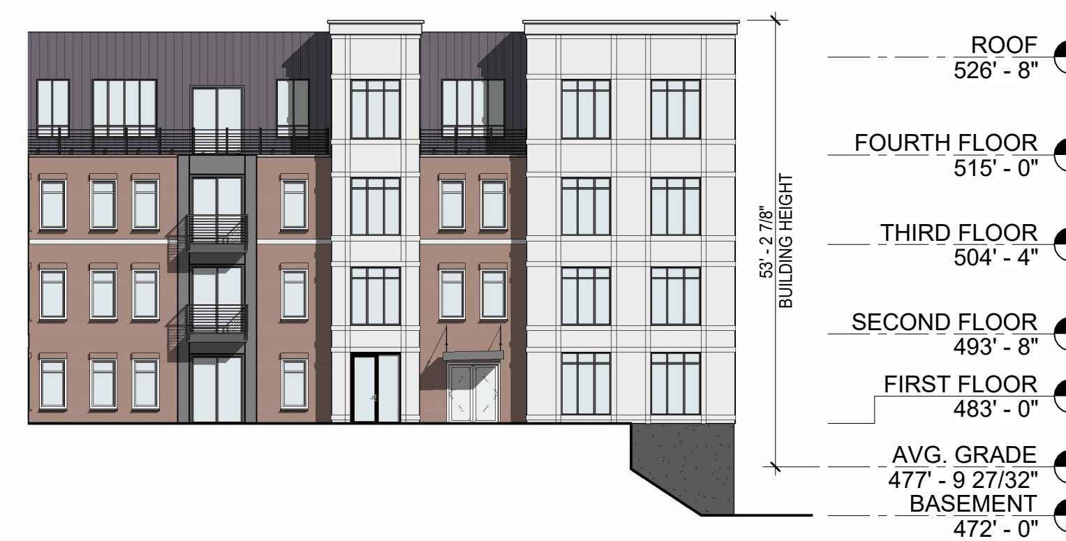
ELEVATION B SCALE: 1/16" = 1'-0" 2