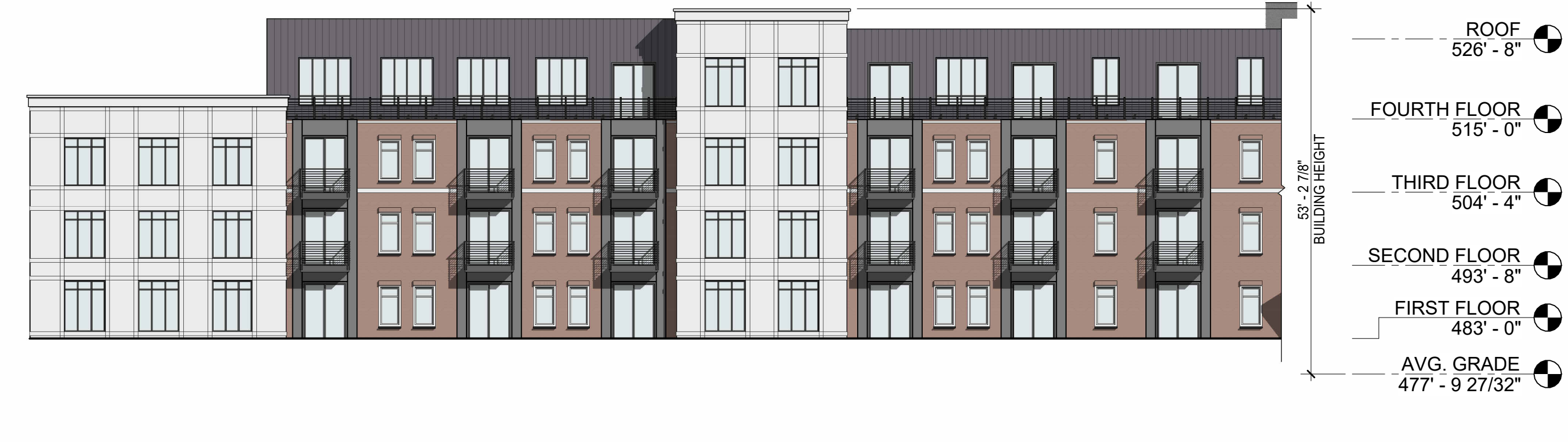
ELEVATION G SCALE: 1/16" = 1'-0" 7