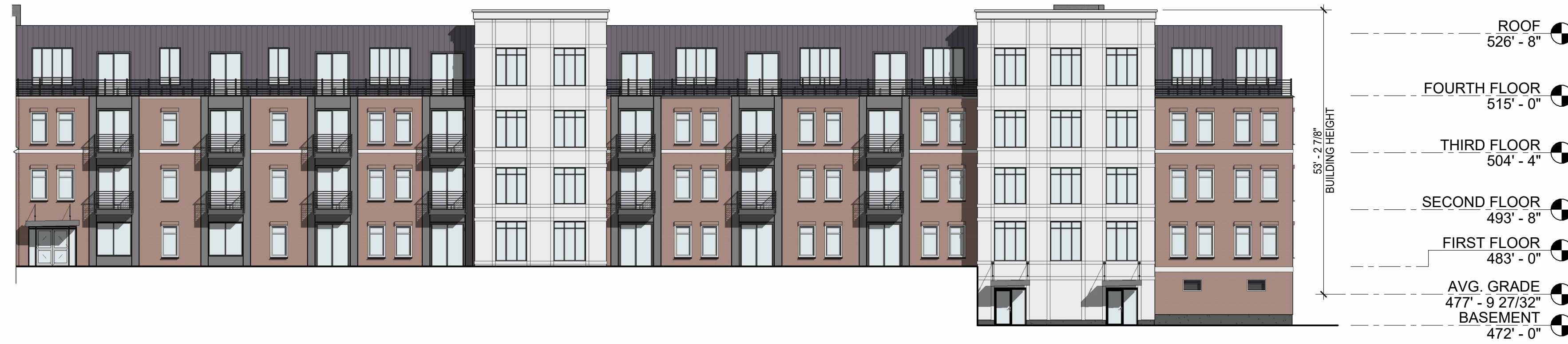
ELEVATION F SCALE: 1/16" = 1'-0" 6