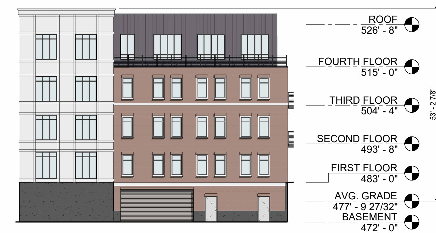
ELEVATION A SCALE: 1/16" = 1'-0" 1