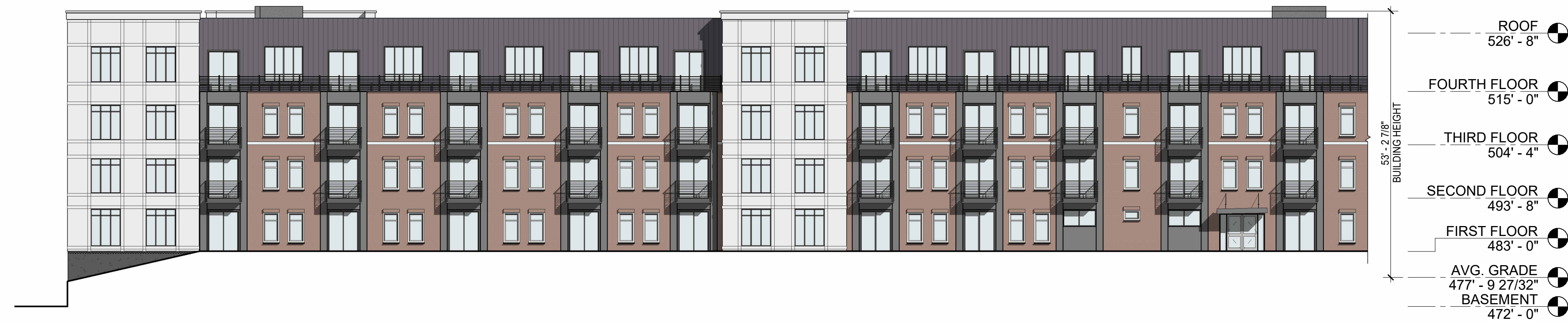
ELEVATION D SCALE: 1/16" = 1'-0" 4